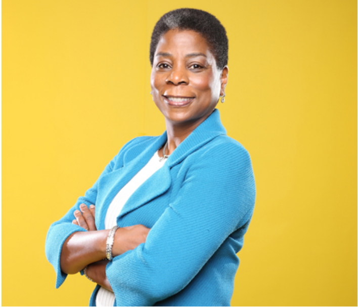
Ursula Burns, CEO of Xerox and Columbia Engineering Alum (MS, Mechanical Engineering 1981).

For disability-related accommodations contact OASID at oasid@tc.edu ; (212) 678-3899; (212) 678-3853 TTY; (646) 755-3144 video phone, as early as possible